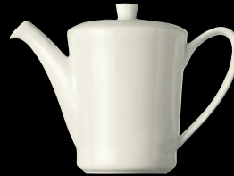
Kaffeekannen-Unterteil | Base coffee pot | Caffettiera senza coperchio 0,30 ltr. | 10 1/2 oz. 34001 Deckel | Lid | Coperchio 34002