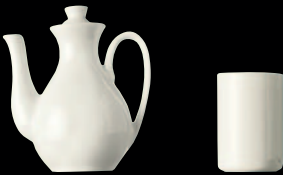
Soja / Essig-Kännchen m. Dkl. | Vinegar / soy sauce port with lid | Acetiera / portasoia con coperchio 0,10 ltr. | 3 1/2 oz. 35003