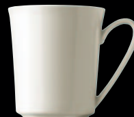
Becher mit Henkel | Mug with handle | Mug con manico 0,40 ltr. | 14 oz. 34659