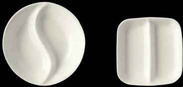
Schälchen rund geteilt | Round compartment dish | Piattino tondo a due scomparti 10 cm | 4 in. 35472