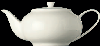
Teekannen-Unterteil | Base teapot | Teiera senza coperchio 0,45 ltr. | 15 7/8 oz. 34261 0,85 ltr. | 30 oz. 34264 Deckel klein | Lid small | Coperchio piccolo 34262 Deckel groß | Lid large | Coperchio grande 34265