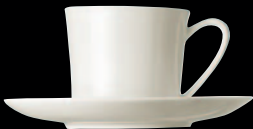
Obertasse | Cup | Tazza 0,20 ltr. | 7 oz. 34749 Untertasse | Saucer | Piattino 15 cm | 6 in. 34636