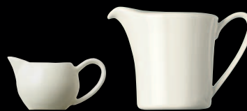
Gießer | Creamer | Lattiera 0,05 ltr. | 1 3/4 oz. 34405 0,20 ltr. | 7 oz. 34420