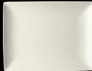
Platte rechteckig | Platter rectangular | Piatto rettangolare 25 x 19 cm | 10 in. 32675