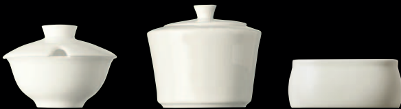
Senf-/Zuckerdosens-Unterteil | Condiment bowl base | Coppetta salsa senza coperchio 0,09 ltr. | 3 1/8 oz. 34366 Deckel mit Einschnitt | Lid with indent | Coperchio con tacca 34367