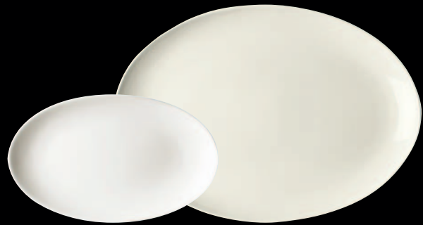
Platte oval | Platter oval | Piatto ovale