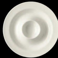
Eierbecher | Flanged egg cup | Portauovo 13 cm | 5 1/8 in. 35525