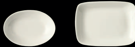
Schälchen oval | Oval dish / spoon stand | Piattino ovale multiuso 10 cm | 4 in. 35474