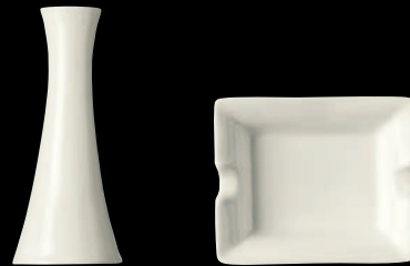
Vase | Vase | Vaso 14 cm | 5 1/2 in. 36014