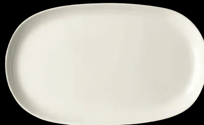
Zucker/Gießer Tablett | Sugar/cream stand | Vassoio multiuso 25 cm | 10 in. 32963