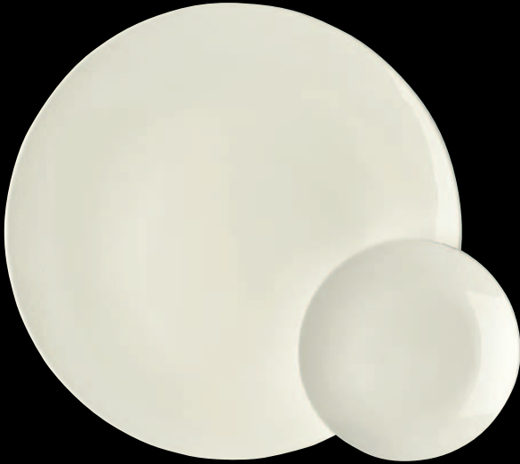
Coupeteller flach | Coupe plate flach | Piatto piano coupe

Dekor | Decor | Decoro 800001 | weiß | white | bianco