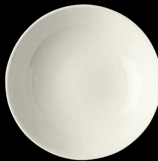
Coupeteller tief | Coupe plate deep | Piatto fondo coupe 19 cm | 7 1/2 in. 30119

Untertasse | Saucer | Piattino 16 cm | 6 1/4 in. 34741