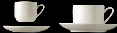
Obertasse stapelbar | Cup stackable | Tazza impilabile 0,10 ltr. | 3 1/2 oz. 34673 0,20 ltr. | 7 oz. 34674 Untertasse | Saucer | Piattino 12 cm | 4 3/4 in. 34611 15 cm | 6 in. 34636