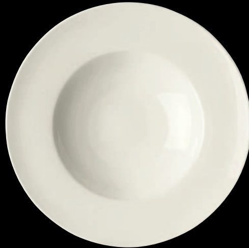
Fahnteller tief | Rim plate deep | Piatto fondo con falda

23 cm | 9 in. 31223 29 cm | 11 3/8 in. 31229