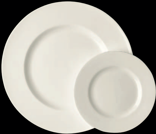
Fahnteller flach | Rim plate flach | Piatto piano con falda

Rosenthal | Hotel & Restaurant Service | Jade | 10640