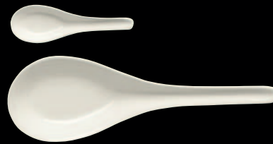
Löffel | Spoon | Cucchiaino 11 cm | 4 1/3 in. 35691 13 cm | 5 1/8 in. 35692 23 cm | 9 in. 35693