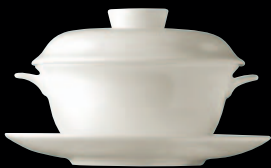
Suppentassen-Unterteil | Soup cup | Tazza consommé 0,25 ltr. | 8 3/4 oz. 30476

23 cm | 9 in. 31223 29 cm | 11 3/8 in. 31229