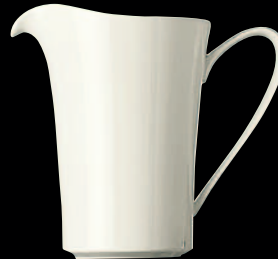
Krug | Jug | Brocca 34492 0,75 ltr. | 26 7/8 oz.