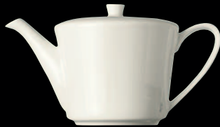
Teekannen-Unterteil | Base teapot | Teiera senza coperchio 0,40 ltr. | 14 oz. 34211 Deckel | Lid | Coperchio 34212

Rosenthal | Hotel & Restaurant Service | Jade | 10640