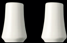
Salzstreuer | Salt shaker | Spargisale 8 cm | 3 1/8 oz. 35030