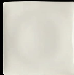
Teller quadr. flach | Square plate flat | Piatto piano quadrato 23 cm | 9 in. 31404 27 cm | 10 5/8 in. 31402