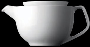
Teekannen-Unterteil | Base teapot | Teiera senza coperchio 0,40 ltr. | 14 oz. 34211 Deckel | Lid | Coperchio 34212