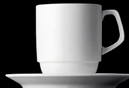
Becher stapelbar | Mug stackable | Mug impilabile 0,25 ltr. | 8 3/4 oz. 34666 Untertasse | Saucer | Piattino 15 cm | 6 in. 34636