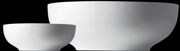
Schüssel | Salad bowl | Insalatiera 15 cm | 6 in. 33015 20 cm | 7 7/8 in. 33020 27 cm | 10 5/8 in. 33027