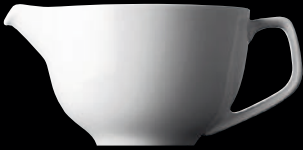
Sauciere mit Henkel | Sauceboat | Salsiera 0,50 ltr. | 17 1/2 oz. 31620

Dekor | Decor | Decoro 800001 | weiß | white | bianco