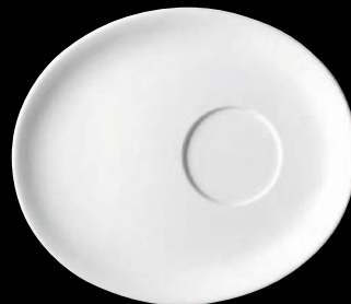
Untertasse oval | Saucer oval | Piattino ovale 19 cm | 7 1/2 in. 34742 für Tassen | for cups | per tazze 34737, 34739, 34743 für Becher | for mug | per mug 34655 für Zuckerdose | for sugar bowl | per zuccheriera 34346