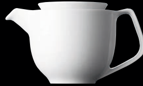
Kaffeekannen-Unterteil | Base coffee pot | Caffettiera senza coperchio 0,30 ltr. | 10 1/2 oz. 34001 Deckel | Lid | Coperchio 34002