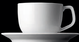
Obertasse | Cup | Tazza 0,18 ltr. | 6 1/3 oz. 34827 0,22 ltr. | 7 3/4 oz. 34642 Untertasse | Saucer | Piattino 15 cm | 6 in. 34636