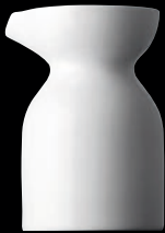
Gießer | Creamer | Lattiera 0,20 ltr. | 7 oz. 34420

Rosenthal | Hotel & Restaurant Service | Nido | 10920