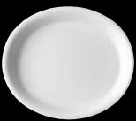
Dipschale oval | Dip bowl oval | Coppetta salsine 9 cm | 3 1/2 in. 35491