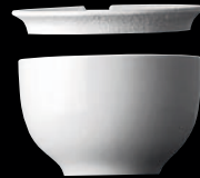
Zuckerdosens-Unterteil | Base sugar bowl | Zuccheriera senza coperchio 0,28 ltr. | 9 7/8 oz. 34346 Deckel mit Einschnitt | Lid with indent | Coperchio con tacca 34348