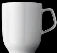
Becher mit Henkel | Mug with handle | Mug con manico 0,30 ltr. | 10 1/2 oz. 34655 Untertasse | Saucer | Piattino 16 cm | 6 1/4 in. 34741