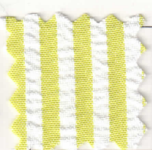
LEMONGRASS W/ WHITE STRIPE